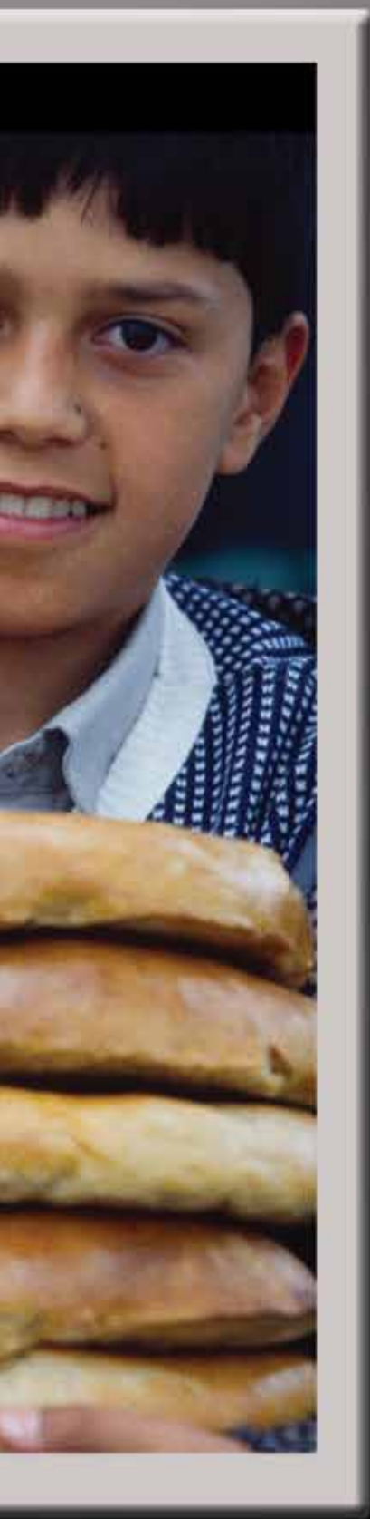
ds traditional bread.