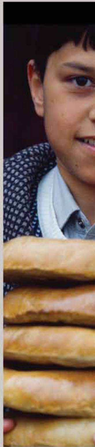
A young Uzbek boy holding a stack of flatbread.